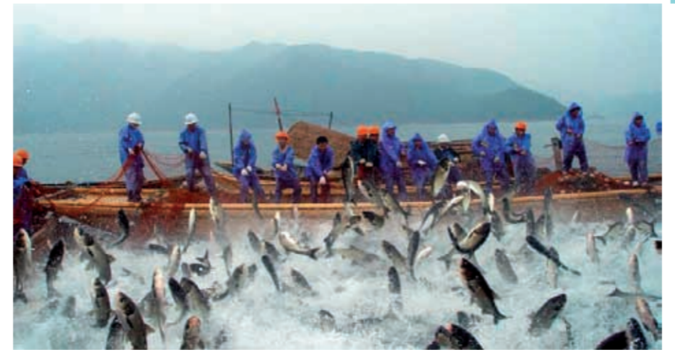
The ASEM Aquaculture Platform facilitates the establishment of the network for Chinese Aquaculture & Fisheries institutes

One of the few truly interdisciplinary aquaculture postgraduate programmes in Europe is organised at Ghent University since 1991. This Master of Science in Aquaculture is firmly research-based and calls upon the relevant expertise of all Flemish universities and the teaching by European and international experts. This programme is also at the centre of the European Master of Science in Aquaculture, a consortium of 7 leading MSc programmes from Ireland, Norway, Poland, Portugal and The Netherlands.