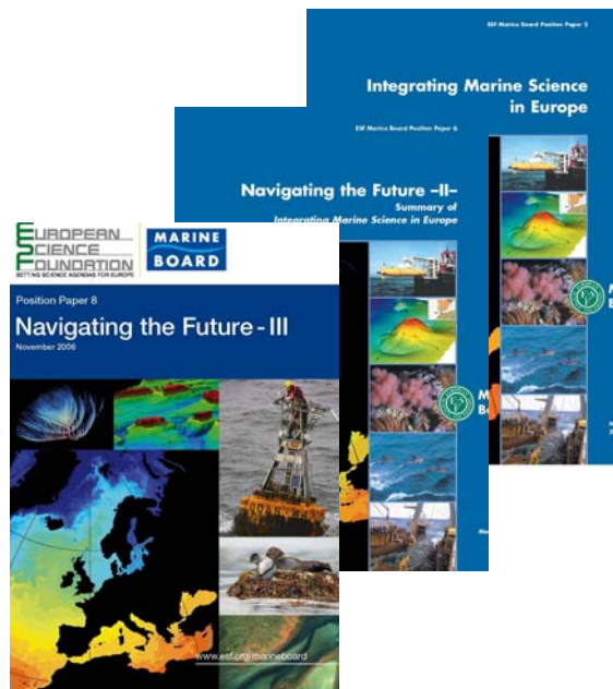
Marine Board Position Papers series