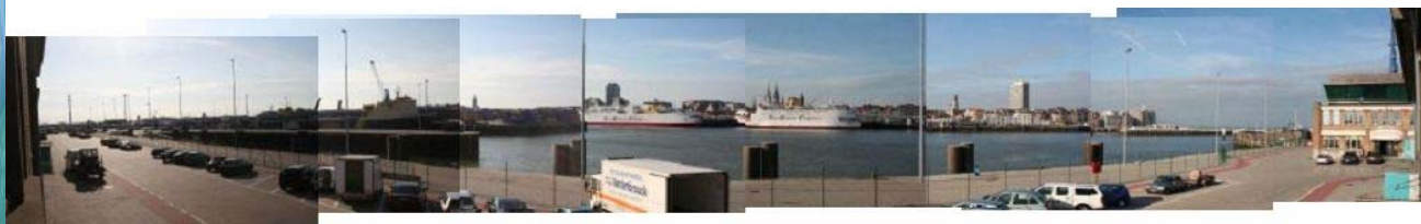
Panoramic view from VLIZ offices