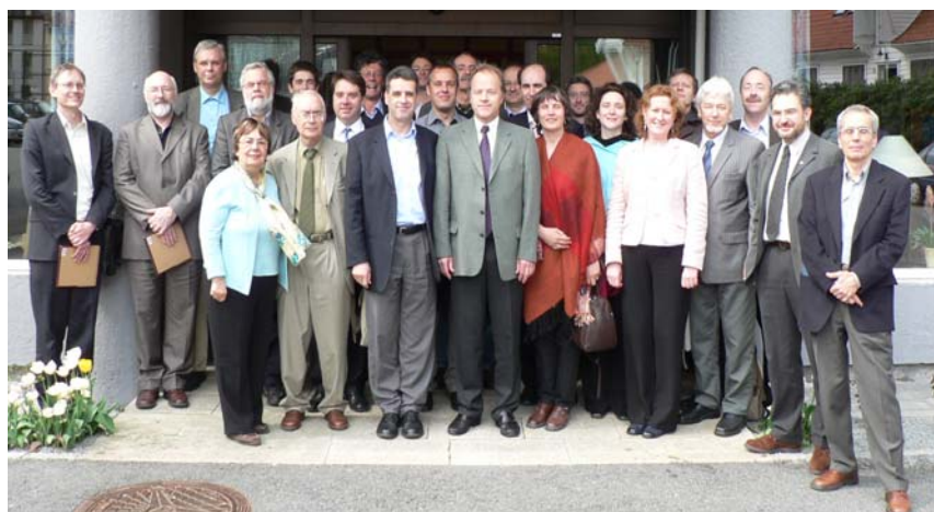
Marine Board representatives in Bergen – Spring 2006 Plenary