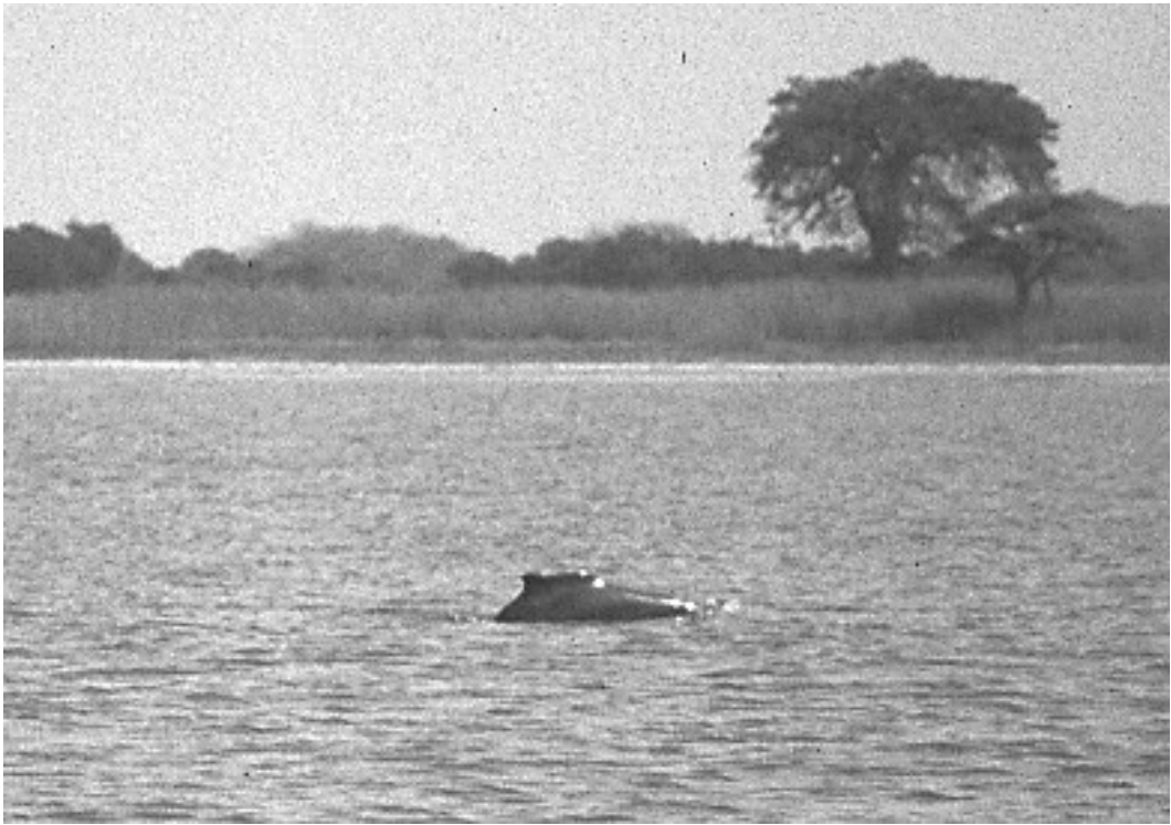
Figure 3. After feeding in a large group at Djinack Creek, Atlantic humpback dolphins of the Saloum-Niumi stock dispersed in smaller groups. One member is here seen crossing the Senegal–The Gambia international border off Djinack Island on 28 October 2000.