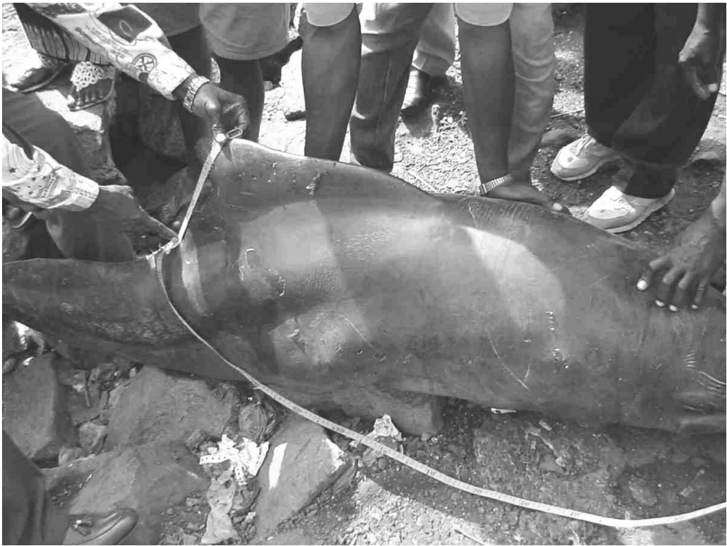
Figure 4. An adult male Atlantic humpback dolphin was taken by artisanal fishers on 13 March 2002 in the Bay of Sangaréah, north of Conakry. This animal, consumed locally, represents the second record of Sousa teuszii for Guinea in half a century, and the first specimen record for the country.

reproductive units, and a concomitant greater risk of virtual local extinction, as we hypothesize for western Ghana.