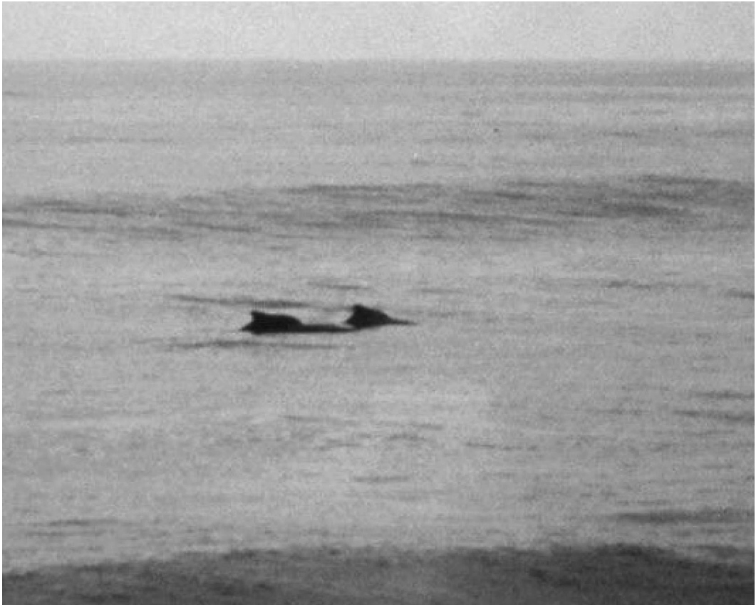
Figure 5. Small groups of Atlantic humpback dolphins were observed almost daily by Alex Vogel nearshore between Namibe and Tombua, southern Angola, in February 1997. This sighting is the first documented record of Sousa teuszii for Angola.