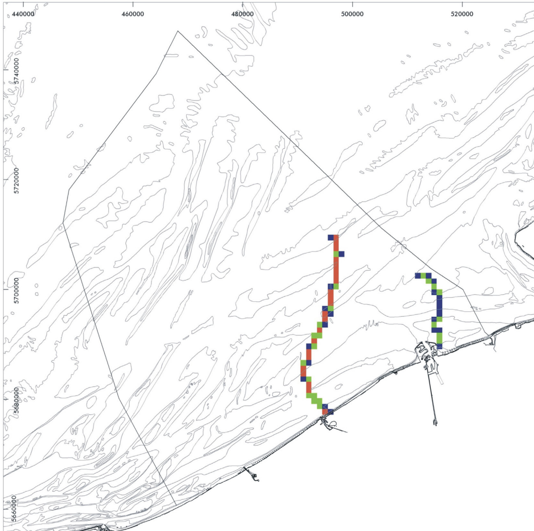
Map I.2.2.c. Electricity cables for wind turbines: use intensity

Use intensity of windenergy electricity cables (length of cable (m)/km 2 )