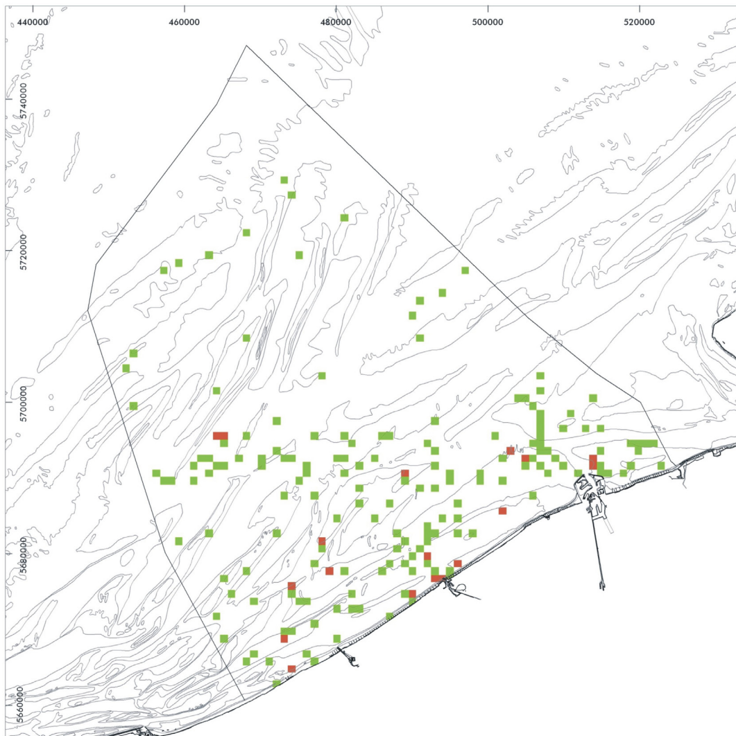
Map I.3.1b. Wrecks: use intensity

Use intensity of wrecks (number of wrecks/km 2 )