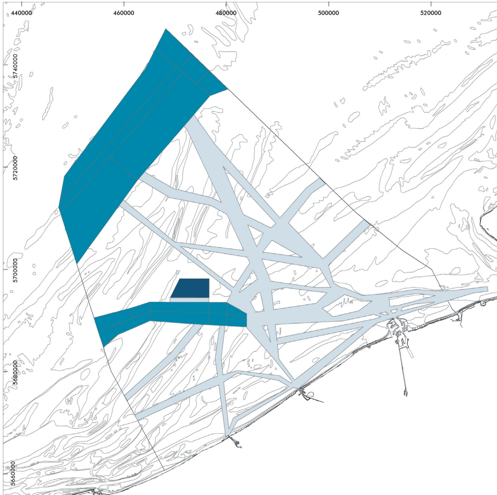
Map I.3.3a. Shipping and anchorage: spatial distribution