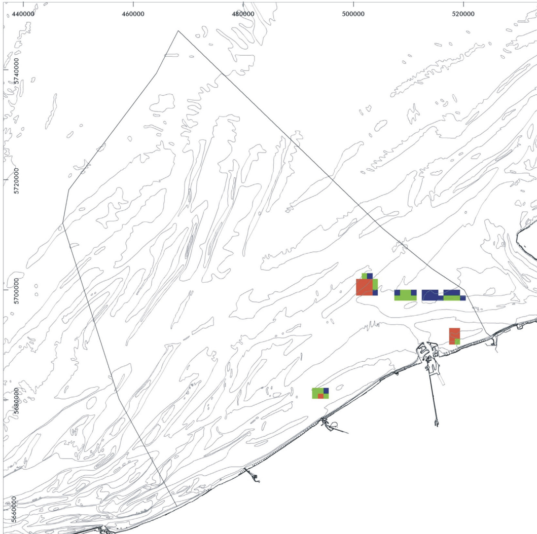
Map I.3.7c. Disposal of dredged material: use intensity

Use intensity of disposal of dredged material (ton dry material (m 3 )/year/km 2 )