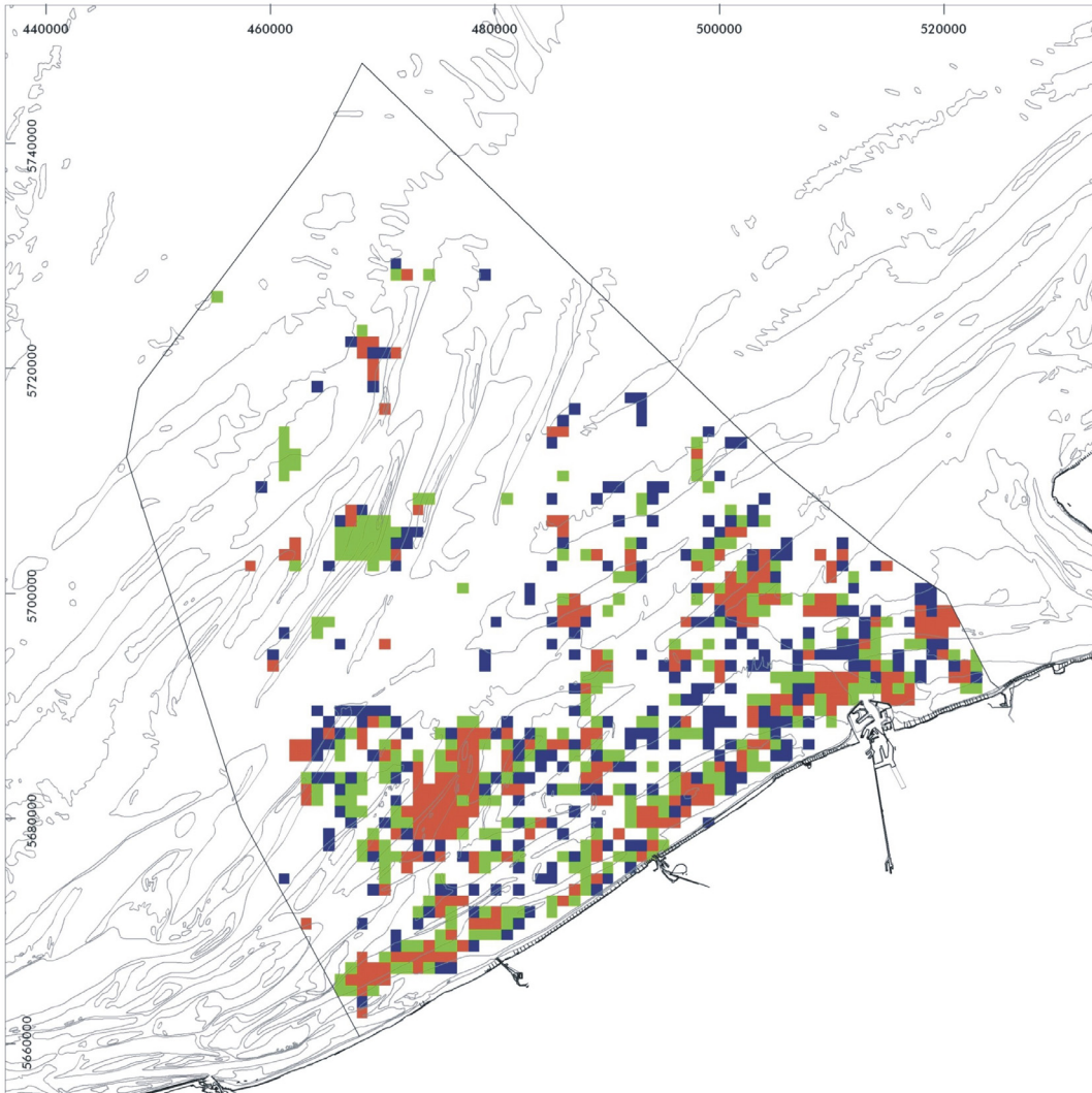
Map I.3.11a. Scientific research (slow): spatial distribution and use intensity

Use intensity of research (speed over ground = < 1 knot (mean presence time/years(hours)/km 2 )