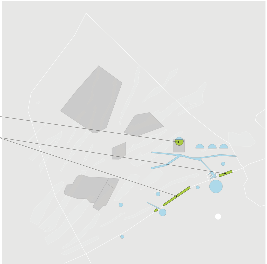
Map II.4d. Dredging and dumping of dredge disposal: positive interactions with other uses (Data analysis and Map preparation: Maritime Institute - Gent University)