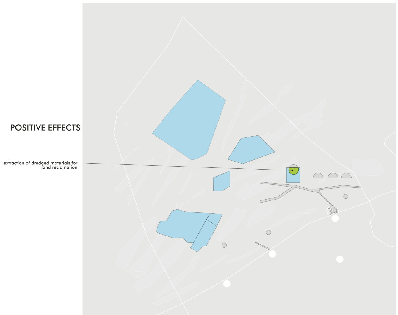
Map II.4f. Sand and gravel extraction: positive interactions with other uses (Data analysis and Map preparation: Maritime Institute - Gent University)