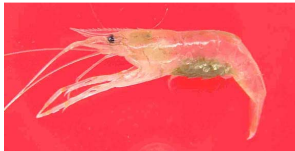
Figure 3. Palaemon macrodactylus , ovigerous female, 45 mm, Gironde Estuary, France

We can assume that interactions between the two species could be considerable and could perhaps lead to a decrease in the native shrimp population abundance. In California, Ricketts et al. (1968) observed that P. macrodactylus was responsible for the disappearance of the native Crangon spp. Furthermore, Gil-Turnes et al (1989) found fungi associated with P. macrodactylus which, if confirmed in the Gironde, raises the possibility of new diseases being introduced that may affect the native shrimps.