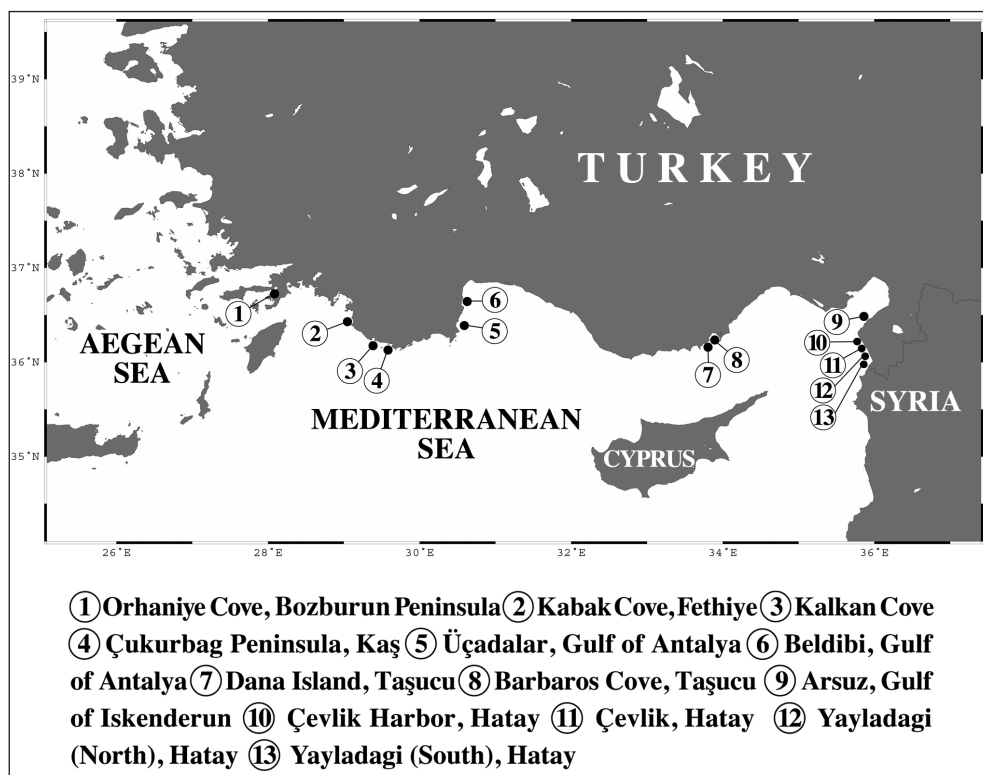
Fig. 2: Map showing the collection sites of Ergalatax junionae .