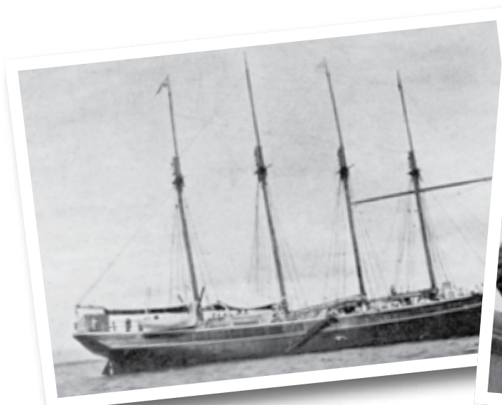
▲ Between 1920 and 1922, the 550-tonne, four-masted motor schooner RV "Dana 1", explored the North Atlantic and the West Indies.