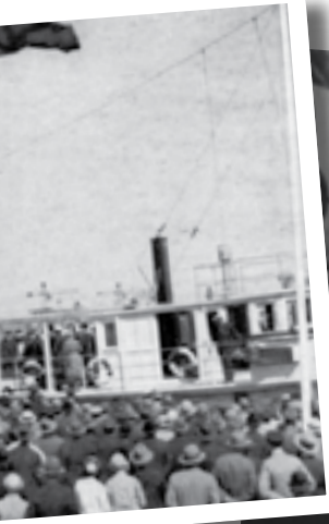
▲ RV "Dana 2" on its triumphal return to Copenhagen on 30 June 1930, after completing its circumnavigation of the globe.