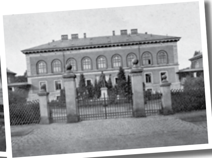
▲ The Carlsberg Laboratory, flanked by the two directors' residences.

Thus, 2010 is the 100th anniversary of the "Thor" expedition on eel early-life history in the Northeast Atlantic, the 90th anniversary of the "Dana 1" expedition on the biogeography of fish eggs and larvae in the North Atlantic, and the 80th anniversary of the completion of the "Dana 2" global expedition on marine biodiversity. As it is also the International Year of Biodiversity and the culmination of the first Census of Marine Life, it is a great year to celebrate and acknowledge the Carlsberg contribution to our knowledge of marine science.