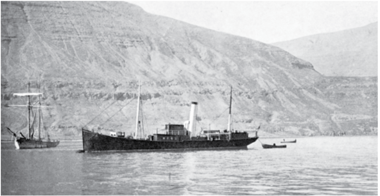
▲ RV "Thor" in Icelandic waters in 1903. It is anchored alongside a French fishing schooner.