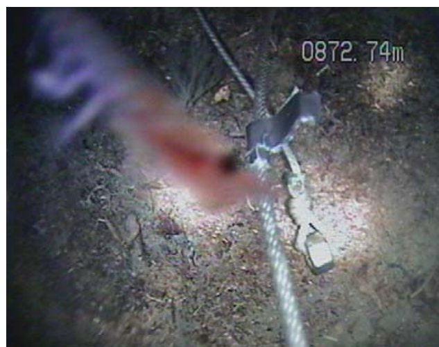
Fig. 2. Krill captured on a video frame at a depth of 775 m below sea level under the Amery Ice Shelf, 100 km from the iceberg calving front. Note also the benthic community on the seafloor. The depth indicated in the top right hand corner is from the ice shelf surface (65 m a.s.l.), and does not take account of non-vertical extension of the tether cable (image centre) under the influence of sub-shelf currents.