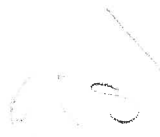
Fig. 1. The SW Netherlands coastal area, with waters mentioned in the text: G = Grevelingen; H = Haringvliet; M = Markie-zaatsmeer; O = Oosterschelde; OM = Oostvoornse Meer; V = Volkerak; VM = Veerse Meer; W = Westerschelde. Also shown is the expansion of the alien rhodophyte Polysiphonia senticulosa (black dots), established in 1993 - by spring 1998 this species was a co-dominant in the algal vegetations where the first collections were made.