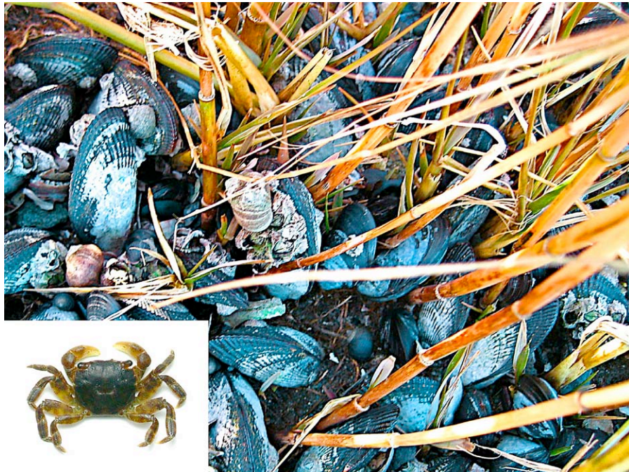
PLATE 1. Cordgrass facilitates ribbed mussels and other intertidal organisms by ameliorating thermal and desiccation stress. Ribbed mussels, in turn, facilitate other species by providing a hard settlement substrate for species including barnacles and crevice space for mobile species such as littorine snails and the invasive Asian shore crab (inset). This facilitation cascade thus enhances both native diversity and the success of invasive species.

scale that can drive broader positive diversity-invasibility relationships (Shea and Chesson 2002, Huston 2004). Our findings thus answer affirmatively the fundamental questions of whether facilitative interactions affect the relationship between native and invasive species, and whether they do so on a scale detectable by experiments (Bulleri et al. 2008).