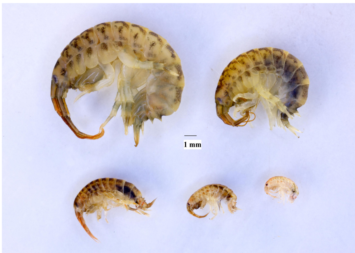
Figure 1. Dikerogammarus villosus in various life stages from Grafham Water reservoir, U.K., September, 2010 (Photograph copyright of Phase4 Environmental Limited).

the less predation prone and larger D. villosus , could have long term implications for native fish populations. In a conceptual risk-assessment model for invasive species in European waterways, D. villosus was cited as a species constituting a high risk in terms of dispersal, establishment and ecological damage (Panov et al. 2009).