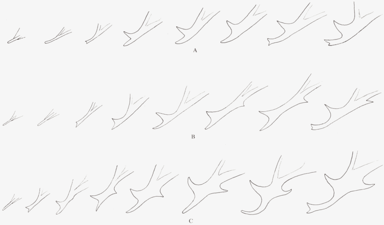
Fig. 1. The right preopercular spines (A) of C. reticulatus of 5, 6.5, 7.1, 8, 9.2, 10, 10.5, 11.4 mm, (B) of C. maculatus of 5.5, 6.5, 7.3, 8, 9, 9.8, 10.5, 11.8 mm, (C) of C. lyra of 4.3, 5, 6.3, 6.9, 8, 9, 11.2, 12.5 mm total length.