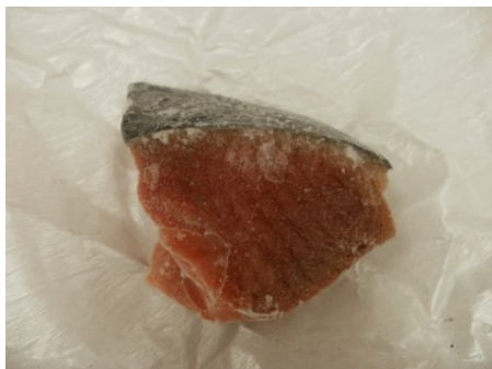
Fig.1 Sample sold as a tuna steak of species Thunnus albacares

Aim: proportion of mislabeling in and around Brussels