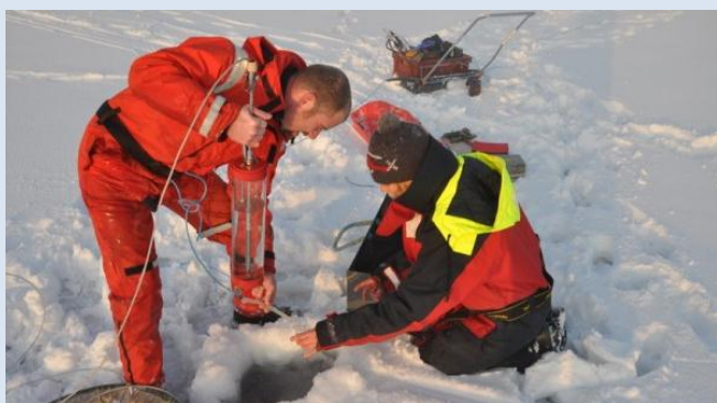
C-14 primary production measurements.

To achieve this, EuroMarine needs to consolidate the partners' commitment using a simple, flexible and transparent consortium agreement to be adopted by all partners and stakeholders in order to launch the establishment of the "EuroMarine Consortium".