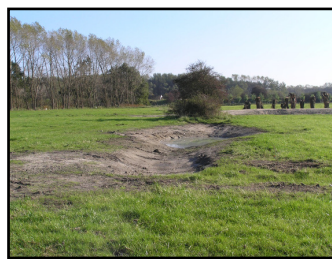
Figure 4: the jumping after the works

- Grazing management : Until the First World War cattle, goats, horses, donkeys and sheep grazed the dunes. As a result of the absence of such grazing since the middle of the 20 th century, grasses and scrubs started to invade the grey dunes, the dune grasslands, and the wet dune slacks. That problem will now be tackled by digging out soil, cutting down trees and shrubs, mowing, and by introducing efficient grazers like Scottish Highland cattle, Shetland ponies and Konik horses. A new grazer that would be re-introduced for the first time in the project area is the Dune Goat, a typical Belgian race of goats that was grazing until the first World War at the Flemish coast. For this reintroduction the Agency for Nature and Forests is working together with ' Foundation Living Heritage ', a non-profit organisation that aims at the maintenance of the original indigenous, mostly very rare local breeds of stock and cattle.