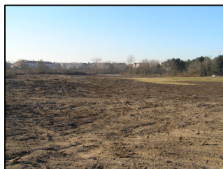
Figure 1 : Restoration of wet dune Slacks in the Groenpleinduinen (2008)

- Restoration of wet dune slacks and pools : Most of the pools and wet dune slacks have in the course of the past decades been subjected to invasion by shrubs and grasses. The shrubs will locally be cleared and existing pools will be deepened and enlarged and some new pools will be dug out.