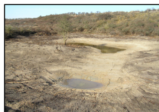
Figure 2 : Restoration of wet dune slacks and pools in the northern grazing unit (2008)