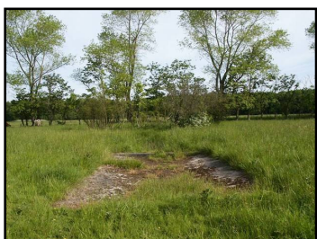
Figure 3: the jumping before the works

- Removal of old infrastructure : Until the sixties every summer a horserace took place, called 'Concours Hippique'. Some old concrete infrastructure of the former jumping remained. Thanks to the LIFE nature project ZENO a pool now replaces the concrete obstacles and makes the original course of the 'Paardenmarkt-Creek' again visible in the landscape and artificial rows of cultivated poplars were removed. This action was executed in September 2007 and restored the wet grasslands and the half-open character of the transitional grounds from dunes to polder.