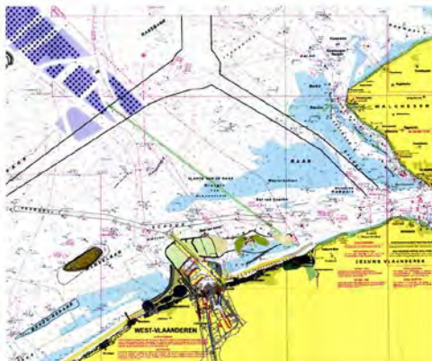
Figure 1 – Zeebrugge area

The vision currently developed for the Flemish Coast is built up around a series of possible projects under the following concepts: Coastal Zone Management, Developing Seaports and Islands.