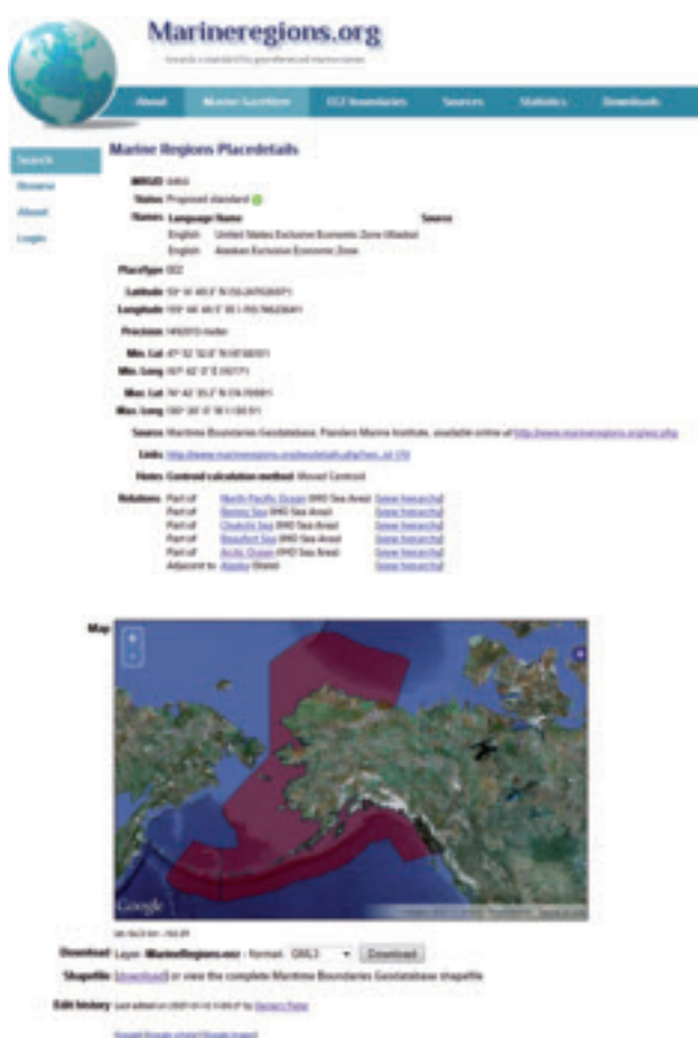
Fig. 1 - Screenshot of the “Marine Regions”, displaying the placedetails, relations, boundaries and download links of the Alaskan part of the US Exclusive Economic Zone.

All geographic objects of the Marine Regions database have a unique identifier, called the MRGID (= Marine Regions Geographic Identifier), used for locating the geographic resources on the web. The different geographic objects are determined by a placetype and coordinates. While the coordinates can be represented as different vector data types (being a point, a multipoint,