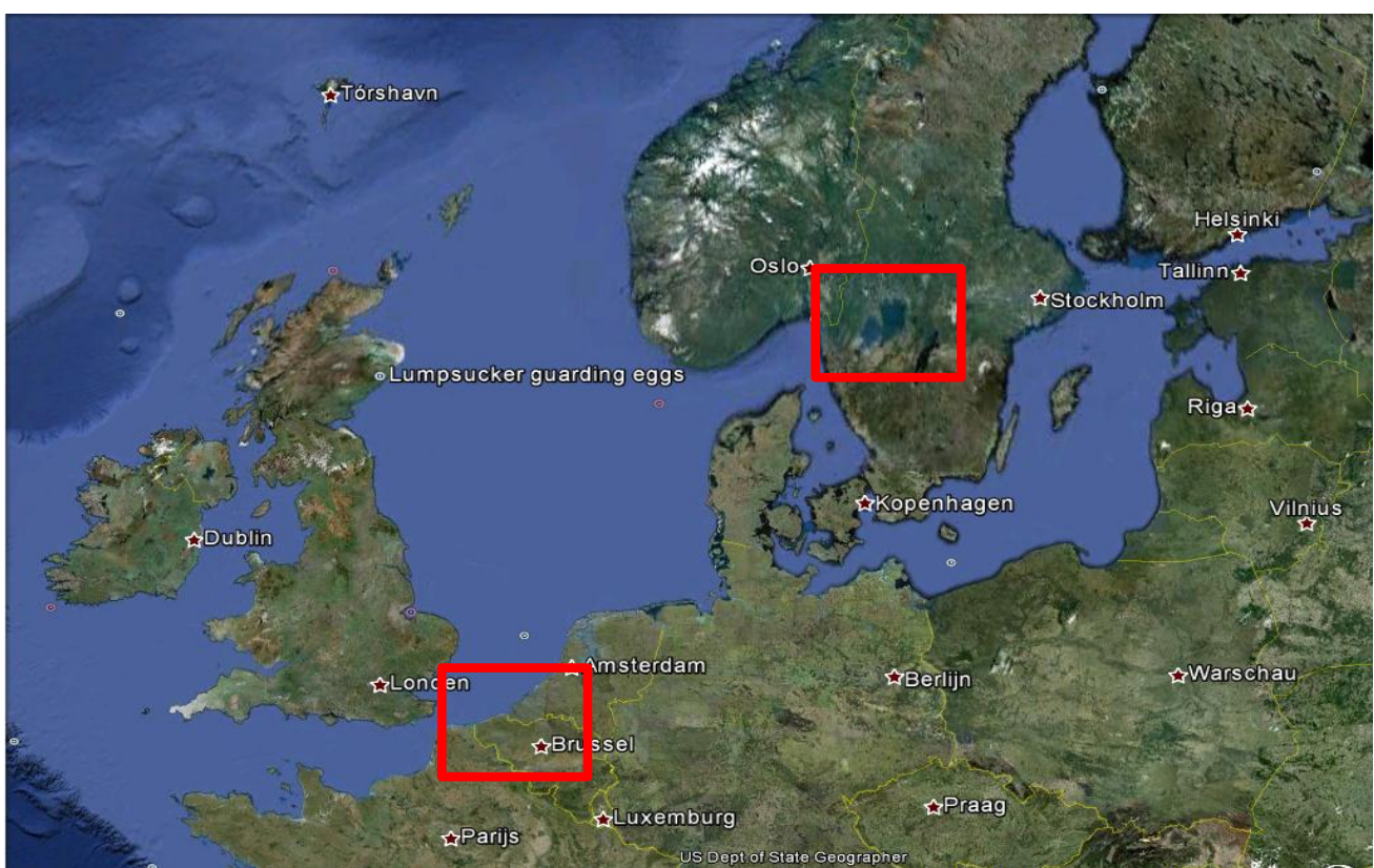
Figure 2: Study areas indicated with red rectangle; top: lake Pålgrunden bottom: North Sea

ICOL (Improve Contrast between Ocean and Land) includes in it formalism the classical adjacency effect (influence of the land albedo) but also (i) the reduction of the coupling between photons reflected by the sea surface and then scattered toward the sensor and (ii) a simplified formalism of the influence of bright clouds. ICOL retrieves the aerosol model over water even turbid waters. ICOL returns a L1 radiance after correction of the adjacency effects. ICOL is available in BEAM ( www.brockmann-consult.de/cms/web/beam/ ) to process MERIS and Thematic Mapper images.