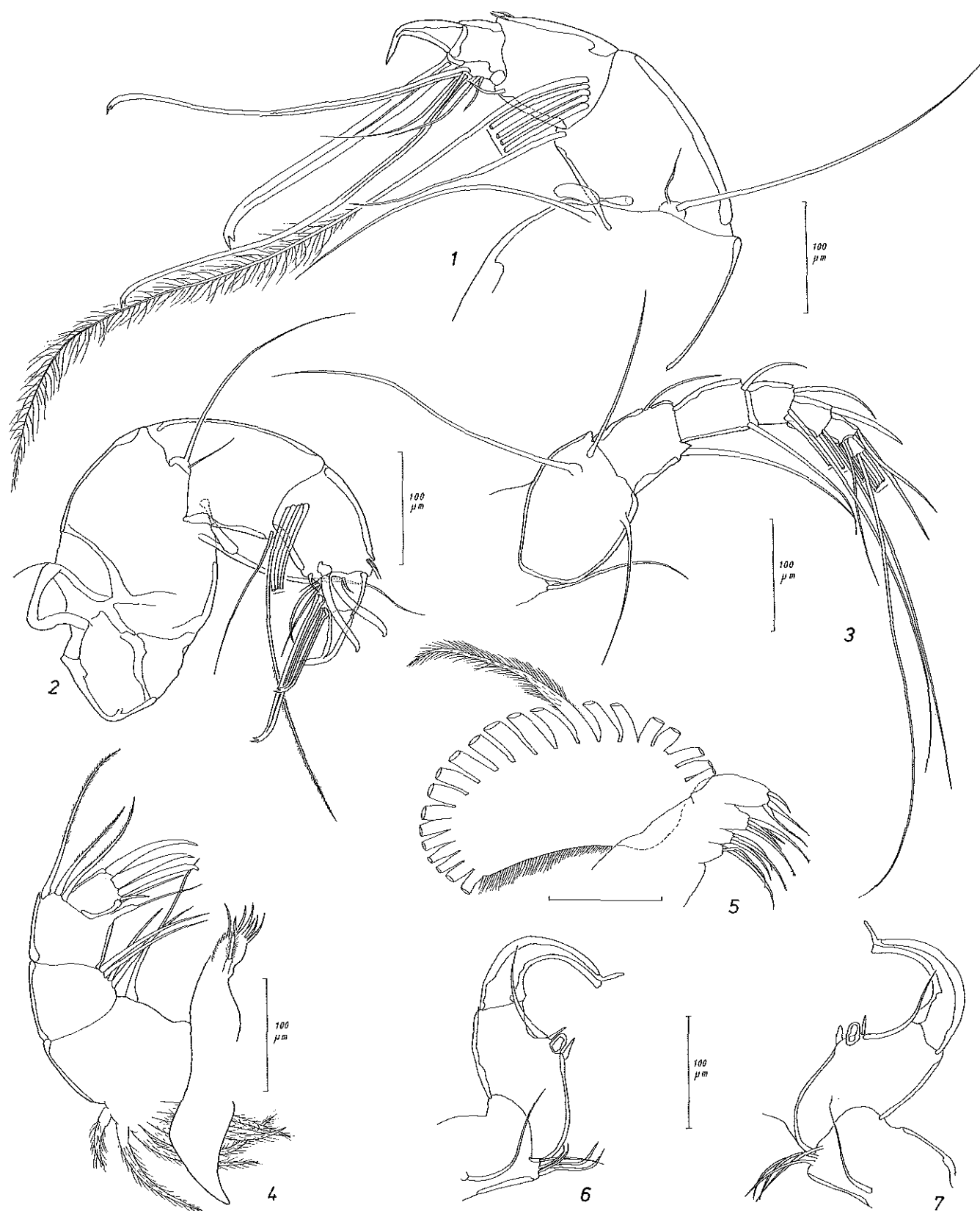
Fig. 1-7. - Pontocypria coriocellae sp. n., Laing Island, Papua New Guinea. Fig. 1. Antenna, female, allotype. Fig. 2. Antenna, male, holotype. Fig. 3. Antennula, male, holotype. Fig. 4. Mandibula, female, allotype. Fig. 5. Maxillula, male, holotype. Fig. 6, 7. Left and right male clasper, holotype.