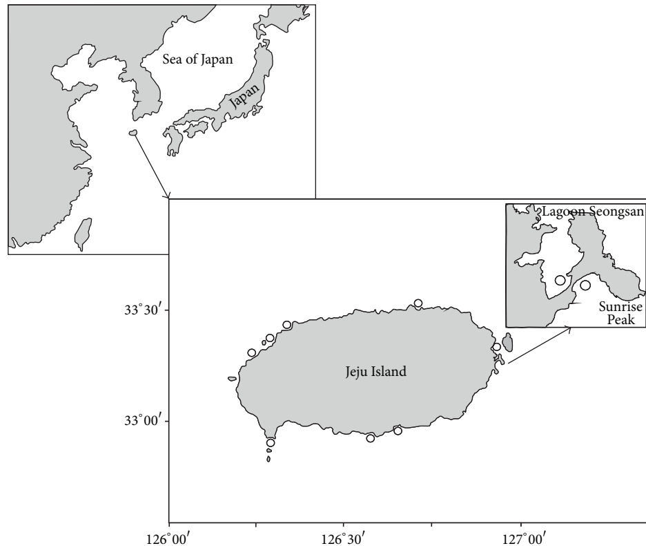
FIGURE 1: Sites of searches for Ruditapes bruguieri shells along the coasts of Jeju Island, South Korea.

ecological characteristics of the species as in such cases it is possible to reveal threshold values of some environmental parameters that restrict the area of the species natural habitat. For instance, a sea water temperature at the northern boundary of species areal can indicate the thresholds of tolerant temperature limits for the species. As for the range of the tropical-subtropical R. bruguieri , its northern boundary runs particularly along the coasts of Korea, and, for this reason, the samples of R. bruguieri from the coastal waters of Jeju Island, South Korea, were studied in the work. Besides, a comparative analysis of ecological parameters of Jeju Island's bays, where R. bruguieri was or was not found by the author and other researchers, has been conducted with the use of the literature data to reveal ecological preferences of the species. Growth and morphometric data for the species were obtained using the clam shell samples from the littoral zones of Jeju Island, as it is known that samples from shell assemblages may be used for growth rate estimation of clams, and such samples give a more comprehensive appreciation of the maximum size and life span of the species than the sample of live mollusks from the natural habitat [11].