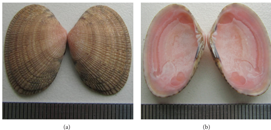
FIGURE 2: The external and inner surfaces of Ruditapes bruguieri shell.

is high, 7.29–8.14 \text{m L}^{-1} [16, 17]. The chlorophyll concentration ranges from 0.71 to 1.71 \text{mg L}^{-1} (mean \pm SE, 1.11 \pm 0.2 \text{mg L}^{-1} ). The concentrations of nitrate, phosphate, and silicate are 0.029–0.206 \text{mg L}^{-1} (0.101 \pm 0.03 \text{mg L}^{-1} ), 0.001–0.027 \text{mg L}^{-1} (0.007 \pm 0.004 \text{mg L}^{-1} ), and 0.024–0.682 \text{mg L}^{-1} (0.454 \pm 0.2 \text{mg L}^{-1} ), respectively [16, 17]. This can be sign that R. bruguieri prefers habitats with good water aeration, stable oceanic water salinity, and high oxygen concentration.