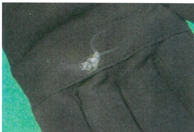
Fig. 1: Phylliroe bucephala off Akhziv

A study of the photographs showed that we were dealing with an odd nudibranch: Phylliroe bucephala Péron & Lesueur, 1810, Fam. Phylliroidae (Schmekel & Portmann, 1982: 169, Fig. 7.46). Most of the information provided here is taken from that work.