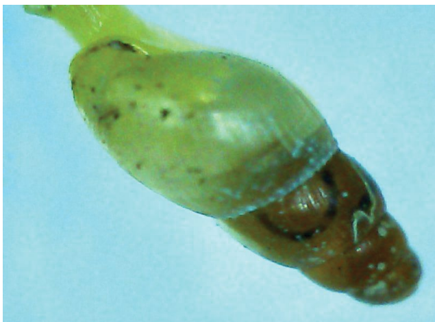
Figure 2: Native snail SUBULINIDAE Leptinaria parana (Pilsbry, 1906), found in “Estreito Continental Neighborhood”, Florianópolis Municipal District, Great Florianópolis region, Santa Catarina State/SC. Specimen with aprox. 4 mm.