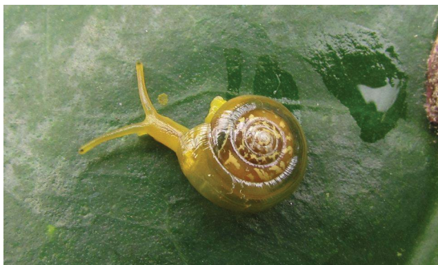
Figure 4: Native forest snail SYSTROPIIDAE Happia sp, species “in determination process” (FURB MO ?) previously cited for the neighbor State of Rio Grande do Sul/RS in Thomé, et al. [12]. Specimen com 19 mm. Agudo-Padrón & Funez [3].