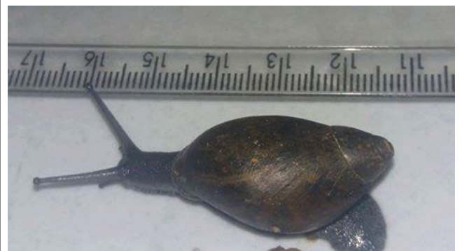
Figure 6: Native forest snail AMPHIBULIMIDAE P. Fischer, 1873 Plekocheilus ( Eurytus ) aff. rhodocheilus (Reeve, 1848), Timbé do Sul Municipal District (28°45'53.46"S ; 49°48'03.52"W - 494 meters above sea level), Santa Catarina State/SC, Southern Brazil region border with the neighboring State of Rio Grande do Sul/RS. Two specimens, with 28 and 31 mm.

From the knowledge available in the last systematic listing generated [2], suppressed synonyms and some other inconsistencies detected that initially went unnoticed, still embedded in recently presented technical data [24], the current inventory of continental freshwater/limnic and land/terrestrial molluscs in the State of Santa Catarina/SC is finally consolidated, with a verified/confirmed record of 232 species and subspecies, including 99 genera (87 Gastropoda & 12 Bivalvia) and 41 families (36 Gastropoda & 5 Bivalvia) regionally known, the most recent being incorporated the natives SUBULINIDAE Leptinaria parana (Pilsbry, 1906) (Figure 2), BULIMULIDAE Bulimulus cf. stilbe (Pilsbry, 1901) (Figure 3), and the exotic invasive indo-asiatic ARIOPHANTIDAE Macrochlamys indica (Benson, 1832) (Figure 5).