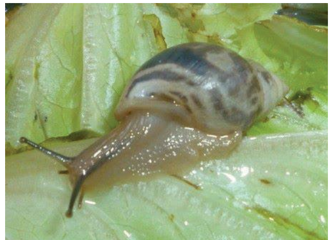
Figure 3: Sandbanks native snail BULIMULIDAE Bulimulus cf. stilbe (Pilsbry, 1901), found in “Ponta do Papagaio” Seaside Resort, Palhoça Municipal District, Great Florianópolis region, Santa Catarina State/ SC. Specimen with aprox. 21 mm.

some more specific and focused studies of the local malacofauna [23], particularly in the specific geographic and ecological region of the Itajaí Valley, the largest river basin of the Atlantic slope in Santa Catarina [18].