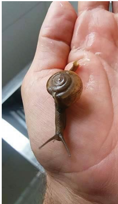
Figure 5: Exotic invasive indo-asiatic snail ARIOPHANTIDAE Macrochlamys indica (Benson, 1832), Ribeirão Café (General Road), Rio do Oeste Municipal District (distant 250 Km from the capital, Florianópolis, in the Upper Itajaí River Basin Valley region); Joinville (city and Municipal District); Palhoça, São José (cities and Municipal Districts) & Estreito Neighborhood (Continental Florianópolis), Santa Catarina State/SC, Central Southern Brazil. Specimen with 21 mm.

Megalobulimus sanctipauli (Ihering, 1900); Happia sp (in determination process) (Figure 4); Macrochlamys indica (Benson, 1832) (Figure 5) - and four bivalves - Corbicula fluminalis (Müller, 1774); Pisidium aff. dorbignyi (Clessin, 1879); Pisidium aff. vile (Pilsbry, 1897); Sphaerium cambaraense (Mansur, Meier-Brook & Ituarte, 2008) were confirmed and added to the inventory.