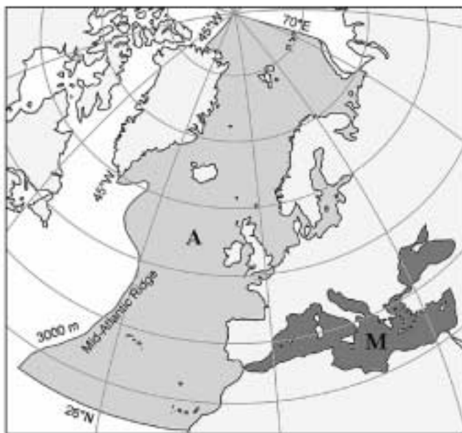
Figure 1. The geographic scope of the ERMS project. A = Atlantic Ocean including Arctic and Baltic Sea, M = Mediterranean Sea and Black Sea.

It is anticipated that the Register will become a standard reference and technological tool for marine biodiversity training, research and management in Europe. The species register can be used to: