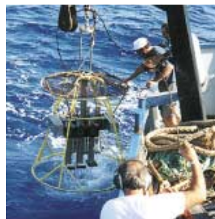
Sampling at sea.

Field experimental studies carried out under Cost-Impact brought to light the complexity of the relationship between demersal fishing effects and changes in biodiversity and