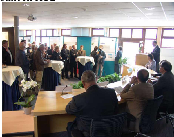
Addressing the Press in the Main Conference Room