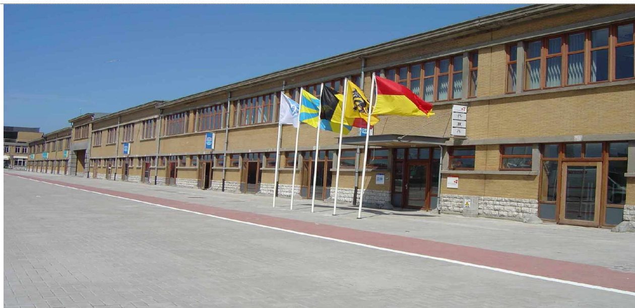
The IOC Project Office for IODE