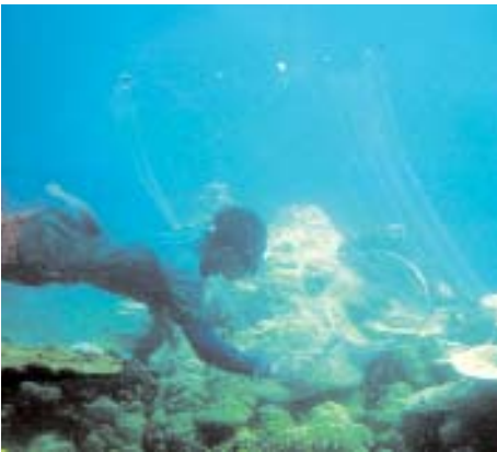
Collecting with net at Marcilla in the Philippines.

MAC-certified marine ornamentals are now moving from ‘reef to retail’ at a pilot scale, engaging market forces in realising the win-win of linking conservation and sustainable use with responsible industry practices. However, the number of MAC-certified organisms available is still less than 1% of the trade. Much of MAC’s efforts are focused on fieldwork in Indonesia and other developing countries that export marine ornamentals, to assist them in capacity-building for community-based reef management plans, training of collectors and other efforts to ensure their aquarium trade is sustainable and can be certified. The need now is to build on the successful start-up efforts and ramp up to a critical mass of certified supply and participants in order to fully realise the benefits