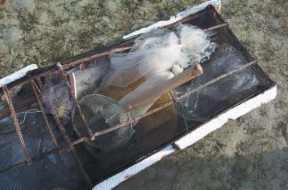
Collectors' gear, Bohol, The Philippines.

Many aquarium-fish collectors and industry members use practices that prove it is possible