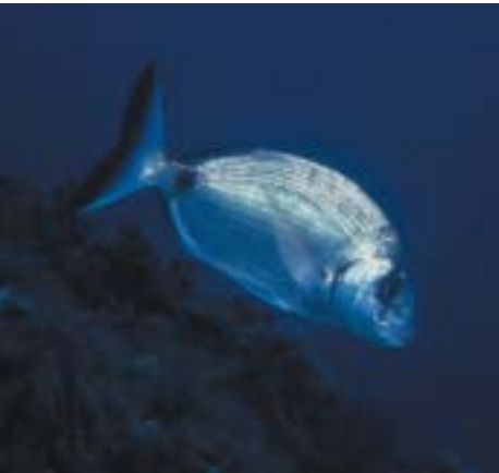
The sea bream Diplodus sargus sargus , predator of adult and juvenile sea urchins in Mediterranean sublittoral rocky reefs.

MARINE ECOSYSTEMS MAY undergo dramatic changes (for example, shifts between alternative community states, changes in ecosystem functioning and food-web disruption) because of the wide array of anthropogenic impacts they are usually subjected to (Pauly et al , 1998; Jackson et al , 2001).