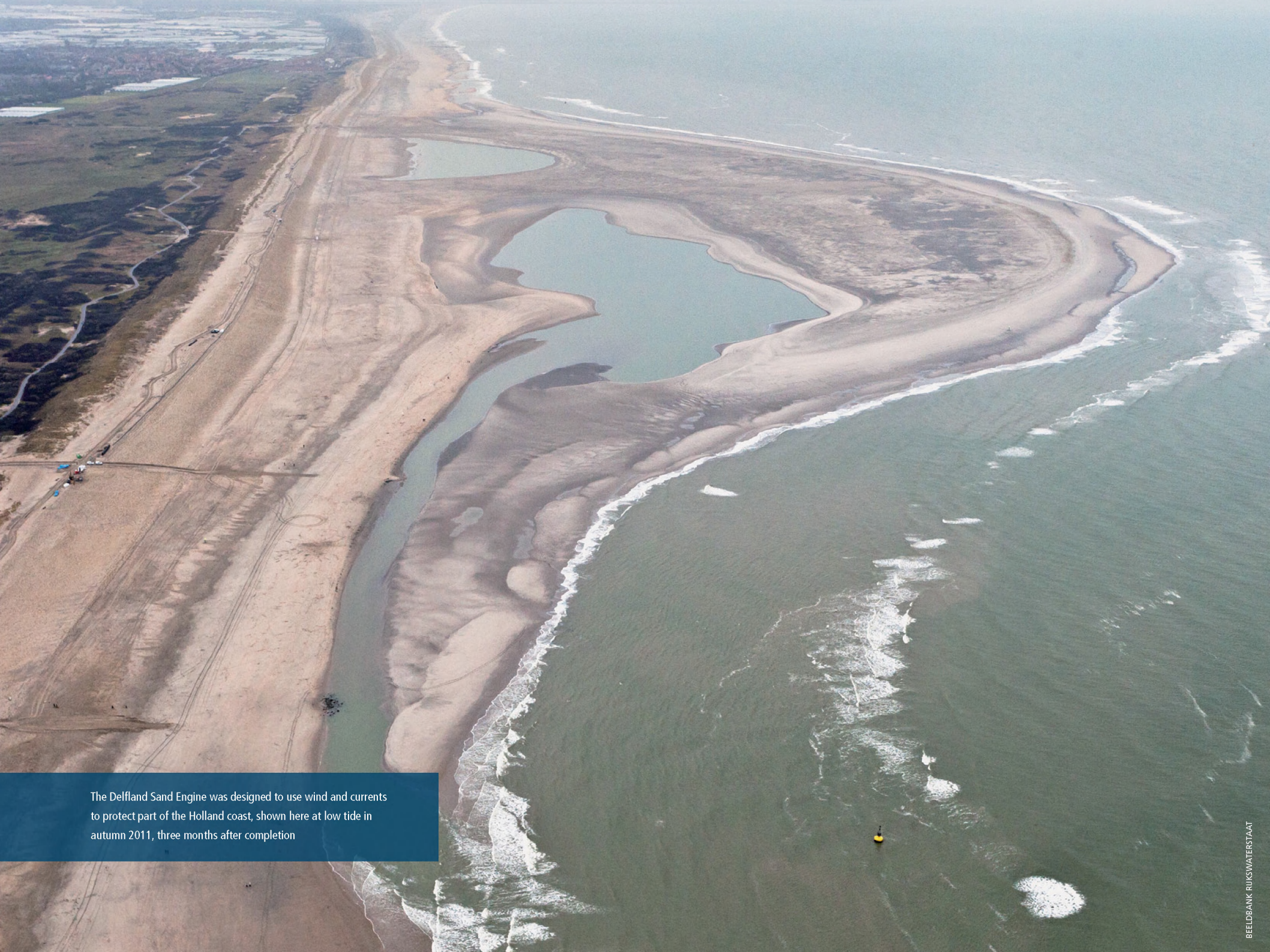
The Delfland Sand Engine was designed to use wind and currents to protect part of the Holland coast, shown here at low tide in autumn 2011, three months after completion