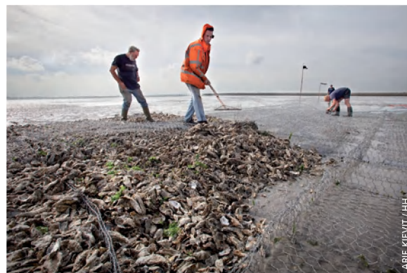
▼ Filling gabions with oyster shells