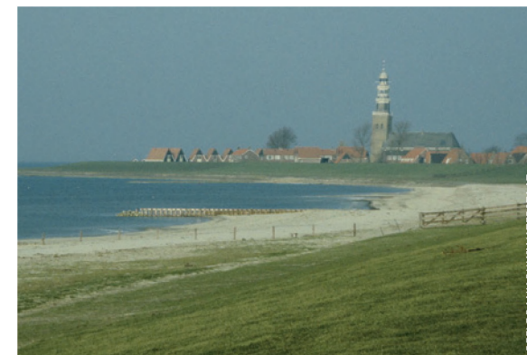
▲ A shallow foreshore of the IJsselmeer

This book presents five examples of Building with Nature projects in which infrastructure developments have been aligned with the natural systems within which they have been built. The projects have been designed to utilize natural processes and provide opportunities for nature to develop.