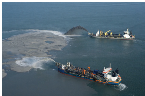
▼ Shore nourishment by rainbowing