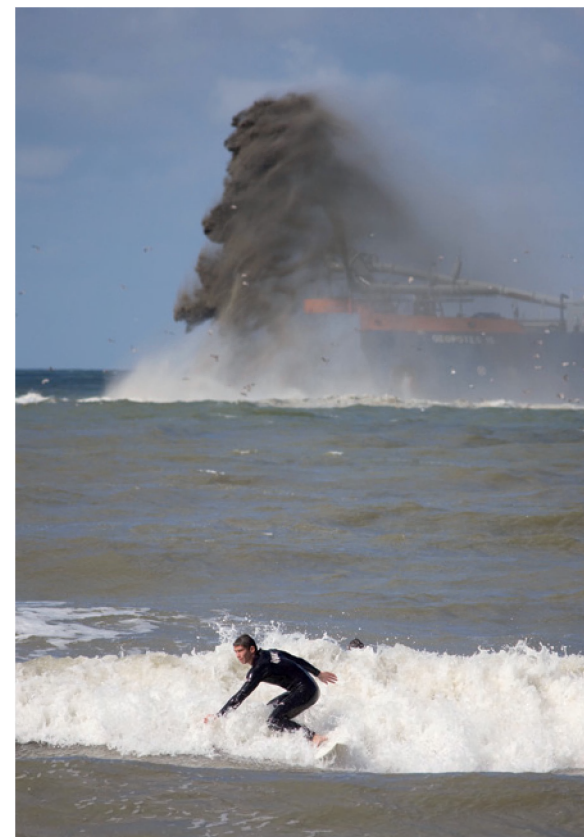
▲ Coastal nourishments such as the Delfland Sand Engine can have positive effects on recreation