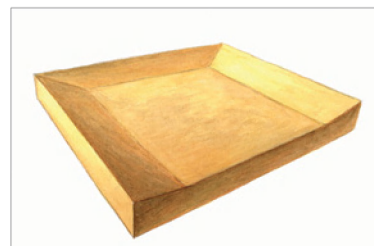
▲ After sand mining, the borrow areas used to be left relatively flat, discouraging the process of recolonization.