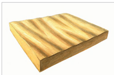
▲ Areas of the seabed with natural sand waves have been found to be ecologically richer than more uniform areas

The recolonization of the Maasvlakte 2 borrow area has been monitored since 2010. 'Inside the pit we actually find four to five times more fish, and more species, than outside it', says Martin Baptist, a marine ecologist at the Institute for Marine Resources and Ecosystem Studies (IMARES) and leader of Building with Nature's monitoring sub-programme. 'We now want to know whether this is because of the seabed landscaping within the pit, or the presence of the pit itself. From the data obtained so far we conclude that the largest assemblages of fish are found near the artificially created bedforms.'