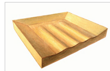
▲ Building with Nature is experimenting with selective dredging, leaving artificial sand ridges in the borrow areas