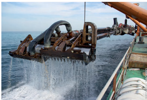
▲ Sand mining in the North Sea

Neither natural nor social systems can be made to change course by pushing a button. In fact their responses to interventions involve many uncertainties. An important aspect of Building with Nature (and society) is finding ways to deal with them. For example,