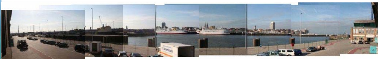
Panoramic view from VLIZ offices