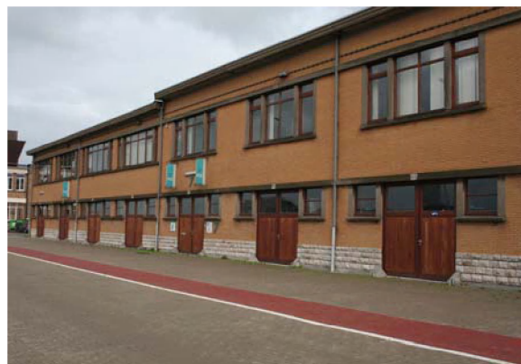
VLIZ building, Ostend - Belgium

The Secretariat of the Marine Board - ESF is set to move from its current location in Strasbourg, France to the site of the Flanders Marine Institute (VLIZ) in Ostend, Belgium.