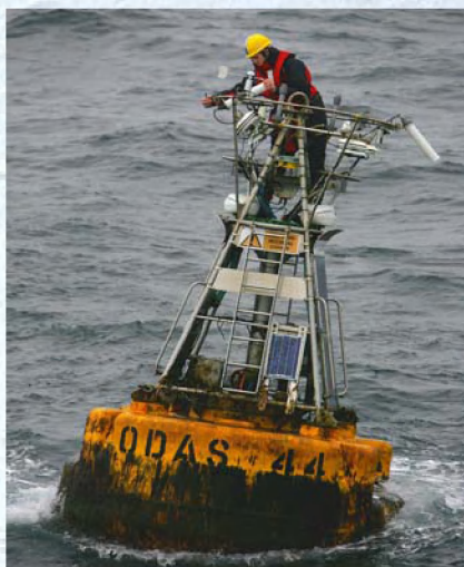
Working aboard a buoy