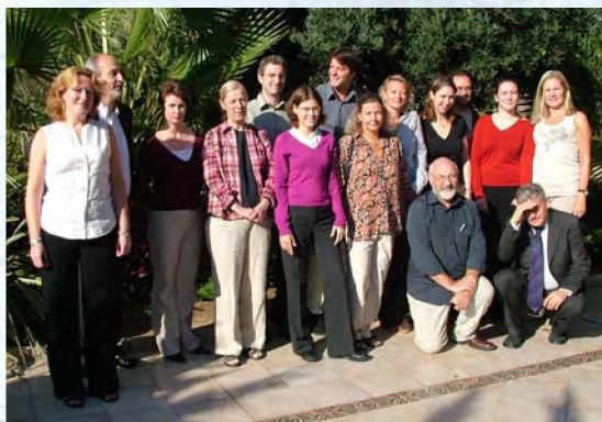
MarinERA meetings in Sant-Feliu (Spain, Oct. 2006)

Task 2.2 Barriers to Cooperation is close to completion. After three workshops and a number of informal meetings, two documents will be produced. The first one, currently under review, is entitled Barriers to Cooperation in MarinERA Partner States Marine RTD Programmes . The second one will be a position paper on barriers and enablers to cooperation (foreseen publication: February 2007).