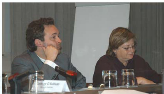
MarinERA 3 th TC meeting (Belgium, April 06)