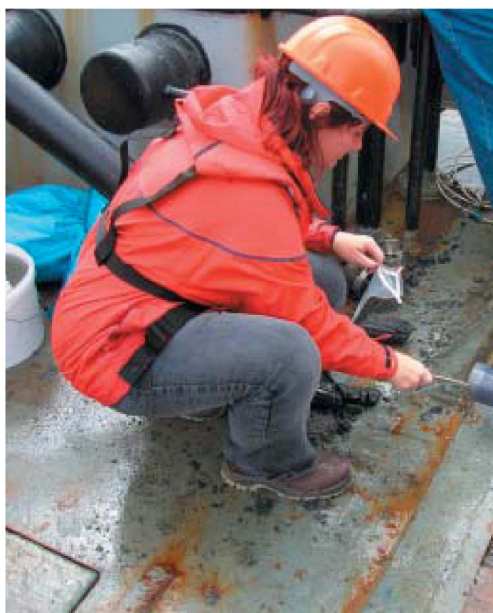
Sampling for sediment samples on a site inspection.