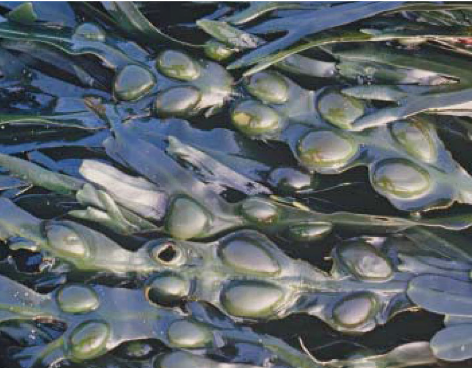
Fucus vesiculosus at low tide.

It is important to note that, today, the copyright of a paper almost always remains with the publisher and that a publisher can withdraw from any collaborative projects within the Open Archive Initiative framework. Nowadays, many publishers agree to change this copyright, so in order to secure open access to your paper, we suggest it is better to ask for inclusion of the following clause in the copyright form of your paper: 'I hereby transfer