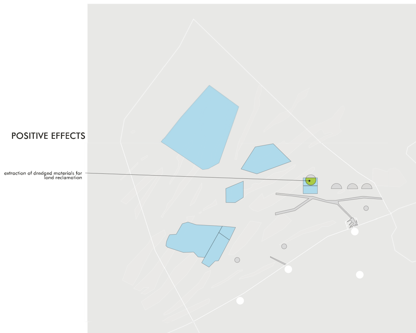
Map II.4f. Sand and gravel extraction: positive interactions with other uses (Data analysis and Map preparation: Maritime Institute - Gent University)