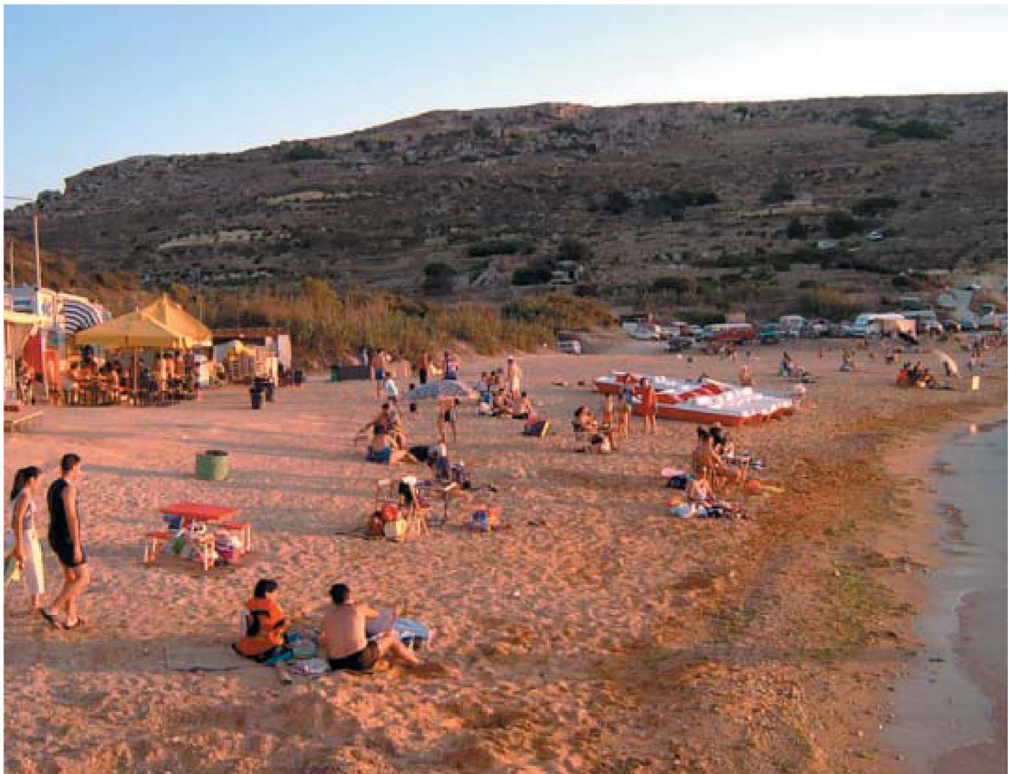
Gnejna Beach, Malta. Conservation of sandy beach macrofaunal assemblages must take into consideration the huge popularity of beaches among tourists and locals, especially on islands reliant on tourism revenue.