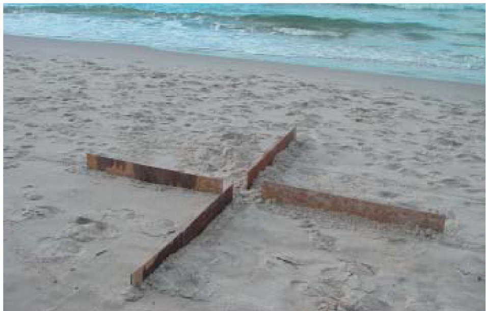
A pitfall trap constellation being deployed along a stretch of the Polish Baltic coast, in Slowinski National Park, in September 2007, in collaboration with the IOPAN institute in Sopot.

The conservation importance of Maltese pocket beaches is further underscored by the presence of a number of endemic species, mainly flightless species of Tenebrionidae ( Stenosis melitana , Erodius siculus melitensis and Pseudoseriscus cameroni ; the latter is listed within Annex II of the EU's Habitats Directive), and others with a very restricted distribution (for example, Clithobius ovatus , known only from the Maltese Islands and Tunisia). On undisturbed sandy beaches, the diversity of psammophilic life can be surprising; for example, on the largely inaccessible Xatt l-Ahmar, a beach on the island of Gozo that only covers an area of 500m 2 , a total individual abundance of 114.3 inds/trap/hr and a total species richness of 36 were recorded during the spring season of 2003, through the use of pitfall traps. On the same undisturbed beach, a stunning 98% of all macrofaunal individuals collected, and 50% of all species collected, were psammophiles. Community taxonomic composition is a good non-quantitative indicator of the degree of human disturbance on a beach – in fact, Deidun & Schembri