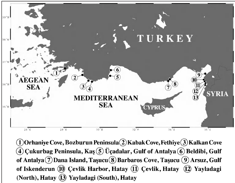
Fig. 2: Map showing the collection sites of Ergalatax junionae .