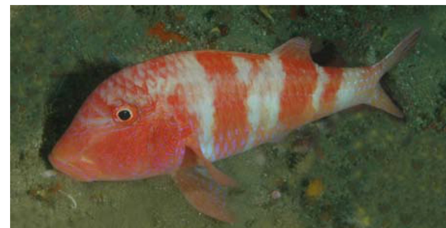
Fig. 5. Parupeneus fraserorum actively feeding, KwaZulu-Natal.