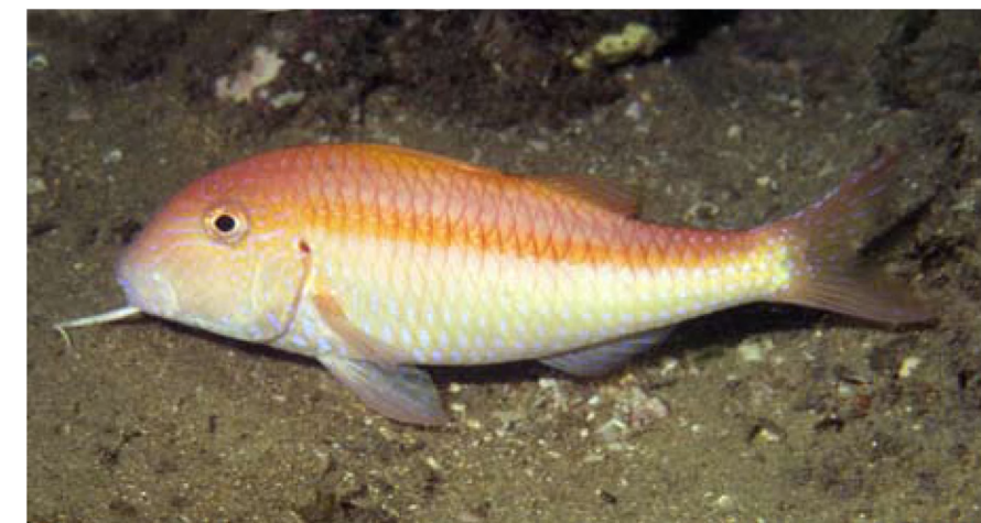
Fig. 4. Parupeneus fraserorum , KwaZulu-Natal.