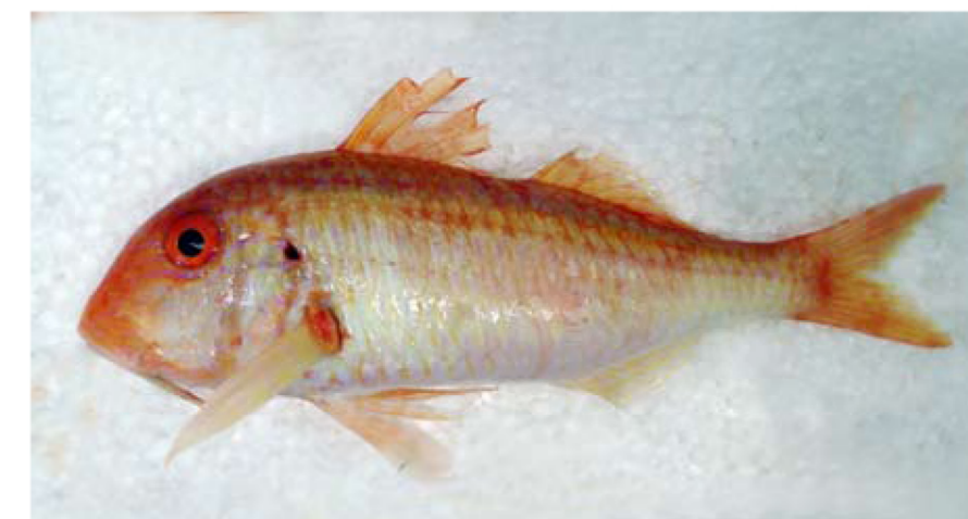
Fig. 6. Parupeneus fraserorum , SAIAB 82829, 117 mm SL, Madagascar.