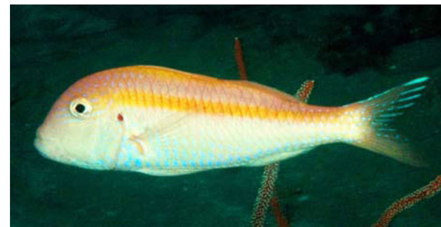
Fig. 3. Parupeneus fraserorum , KwaZulu-Natal. (Photo by Dennis R. King).

RANDALL, J. E. 2004. Revision of the goatfish genus Parupeneus (Perciformes: Mullidae), with descriptions of two new species. Indo-Pacific Fishes 36: 1–64.