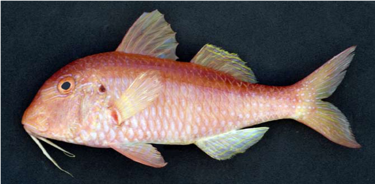
Fig. 1. Holotype of Parupeneus fraserorum , SAIAB 81385, 166.5 mm SL, KwaZulu-Natal.

parentheses refer to paratypes. The data in the table of measurements of the new species are given as percentages of the standard length. Proportional measurements in the text of the diagnosis and description are rounded to the nearest 0.05. Counts of pectoral-fin rays were made on both sides.