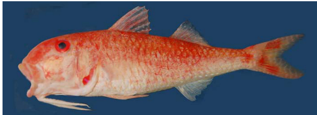
Fig. 8. Paratype of Parupeneus nansen , USNM 395047, male, 139 mm SL, Mozambique, 26°9.5'S, 32°58.5'E, 43–45 m.

Scales finely ctenoid; scales dorsally on head extending forward to an orbit diameter from front of upper lip; six oblique rows of large scales on cheek to edge of preopercle; the first two rows embedded, extending above curved posterior part of maxilla, the last row of two scales at corner of preopercle; opercle largely covered by seven partially fused scales of variable size; subopercle and interopercle covered by a row of six scales, progressively shorter anteriorly; two scales on expanded posterior side of maxilla, the anterior about one-third size of posterior and overlapping base of posterior scale; fins naked except for base of caudal fin with three rows of scales like those of body, followed by columns of small slender scales extending about half way out in fin; slender pelvic axillary scale nearly one-half length of pelvic spine; a midventral scaly process of two rounded scales at base of pelvic fins, the anterior broadly overlapping the posterior; sensory canals on