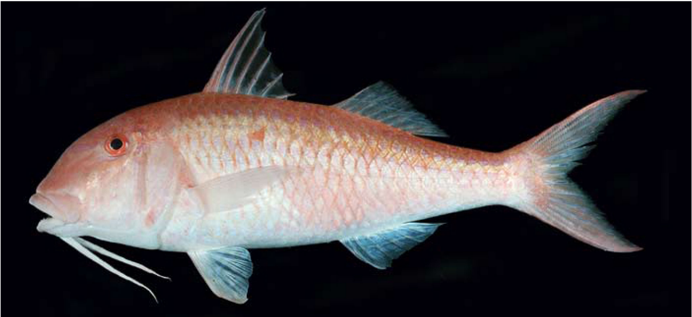
Fig. 2. Parupeneus heptacanthus , HUJ 8330, 225 mm SL, Gulf of Aqaba, Red Sea.