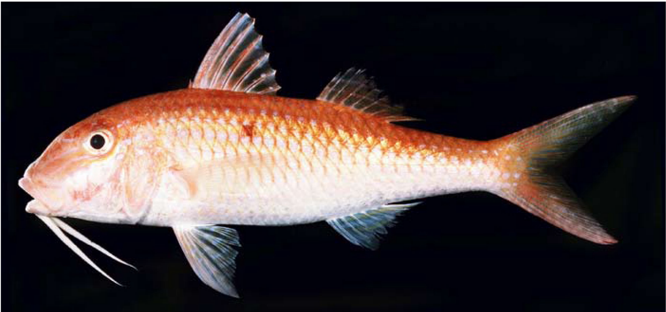
Fig. 1. Parupeneus heptacanthus , BPBM 29732, 130 mm SL, Lombok, Indonesia.

freshly caught specimens, has revealed a third new species with a symmetrical maxilla. It is described here from four specimens taken by trawling off the coast of southern Mozambique in 43–51 m. Seven additional specimens of this species were found in the Bishop Museum fish collection misidentified as P. heptacanthus (Lacepède); they were taken by trawl in 25–29 m off the northeastern coast of Somalia. Because information is lacking on the life colour of these specimens, they are not designated as paratypes. In their book The Fishes of the Seychelles , Smith & Smith (1963: 22, pl. 88 B) named a new species of Parupeneus as Pseudupeneus seychellensis from one specimen from a market in Mahé, Seychelles. Their