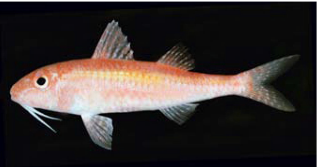
Fig. 5. Holotype of Parupeneus minys , BPBM 35553, 70 mm SL, Poivre Atoll, Amirantes, Seychelles, 43–48 m (Photo by J. E. Randall).

Paratypes . BPBM 40948, female, 83.5 mm, USNM 395007, female 79.5 mm, both with same data as holotype; BPBM 27693, female, 83 mm, India, Kerala, Vizhinjam fishing harbour (south of Trivandrum), purchased from fisherman, J. E. Randall, 13 February 1980; MNHN 2008-2473, male, 106 mm, same data as preceding; SAIAB 81381, male, 106.5 mm, Mozambique, 20°14.8'S, 35°48.4'E – 20°16.3'S, 35°48.4'E, R/V Dr. Fridtjof Nansen Station 76, trawl, 54–55 m, P.C. & E Heemstra, 12 October 2007.