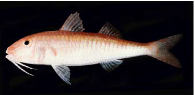
Fig. 6. Paratype of Parupeneus minys , BPBM 27693, 83.5 mm SL, Kerala, India.

DIAGNOSIS. Pectoral-fin rays 15 or 16; gill rakers 6 + 21–22; body elongate, the depth 3.95–4.3 in SL; head length 2.9–3.05 in SL; interorbital space flat medially; snout length 2.05–2.3 in HL; posterior edge of maxilla symmetrically convex; maximum depth of maxilla 5.45–5.8 in HL; barbel length 1.35–1.45 in HL; longest dorsal spine 1.8–1.95 in HL; pectoral fins 1.3–1.4 in HL; pelvic fins 1.5–1.65 in HL; colour in alcohol uniform tan except for specimens from the Seychelles with areas of white ventrally on head below eye and on lower two-fifths of body; no dark markings; fins translucent pale yellowish; colour when fresh, pink dorsally, pale pink to white ventrally, with an indistinct pale yellow stripe along lateral line; some lateral-line scales with a bluish white dash; a bluish white line encircling ventral part of eye and continuing obliquely to upper lip; three small bluish white blotches dorsally on head, one directly above eye; barbels white; median and pelvic fins translucent blotchy yellow with small pale blue to whitish spots along rays that outline faint transverse yellowish bands. Largest specimen, 106.2 mm SL.