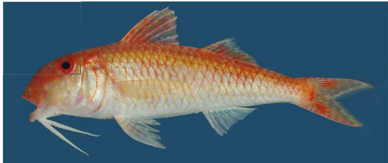
Fig. 7. Holotype of Parupeneus nansen , SAIAB 81380, 125 mm SL, Mozambique, 24°33'S, 35°15'E, 50–51 m.