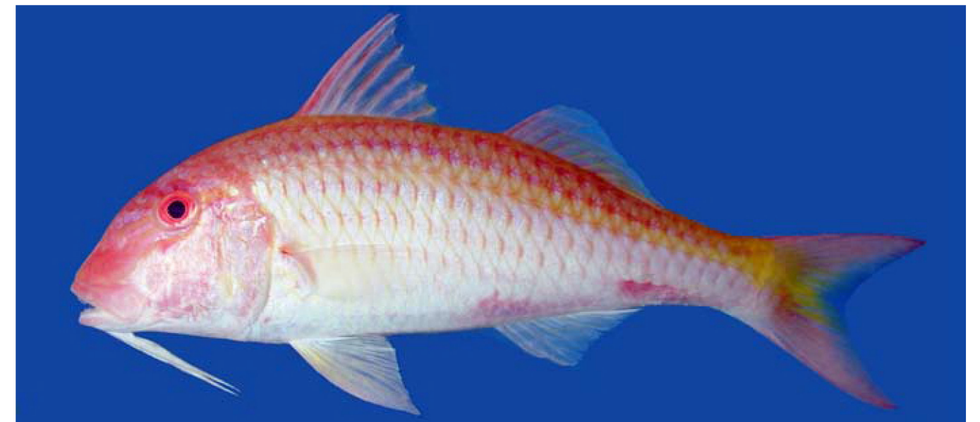
Fig. 9. Parupeneus seychellensis , SAIAB 77868, 170 mm SL, Mahé, Seychelles, 17 m.

The pectoral-ray counts of 15 or 16 (mainly 16) and the gill-raker counts of 6 or 7 + 21–23 of Parupeneus nansen are the same as those of P. heptacanthus . The two species are readily distinguished in life colouration (compare Figs. 2 and 3 of P. heptacanthus with Figs. 7 and 8 of P. nansen ). The most important morphometric differences are the longer barbels of P. heptacanthus , 1.0–1.3 in HL in 15 Bishop Museum specimens, 60–257 mm SL, compared to 1.3–1.45 in HL of P. nansen , and the pelvic fins are longer in P. heptacanthus , 1.3–1.5 in HL, compared to 1.5–1.65 in P. nansen .