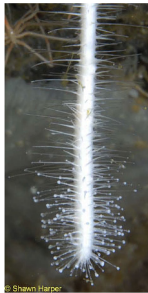
Fig. 2 Asbestopluma ( Asbestopluma ) vaceleti n.sp. Detail of branch ending and swollen apices of filaments of in situ specimen

Synonymy Asbestopluma aff. lycopodina (sic); Brueggeman 1998: 9.