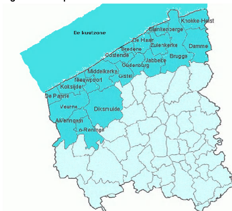
Figure 8.1 Map Flemish coastal zone

The tourist-recreation sector is important for the Flemish employment structure: the sector ranks in seventh place. In the Flemish coastal area, employment generated by the coastal tourism sector is even more important. Indeed, the coast of Flanders has always been a top tourist destination in Belgium. Consequently, the coastal tourism sector has never really had to put a great deal of effort into developing a coherent tourist policy or plan. This has caused fragmentation in the supply of services, and environmental aspects and architectural heritage have been somewhat ignored. The situation, however, has changed dramatically in the last few years. Competition has increased and tourists are demanding more professionalism and better quality from service providers. In addition, the number of tourists spending longer holidays on the Flemish coast has dropped; visitors increasingly prefer to stay for a short duration. Consequently, there is a demand for a more pro-active approach to take these developments into account.