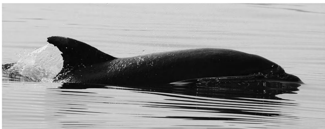
Figure 2: A bottlenose dolphin ( Tursiops truncatus ) showing distinct identifying marks on the dorsal fin.

Slika 1: Preučevani ohmočji sta med seboj oddaljeni približno 150km.