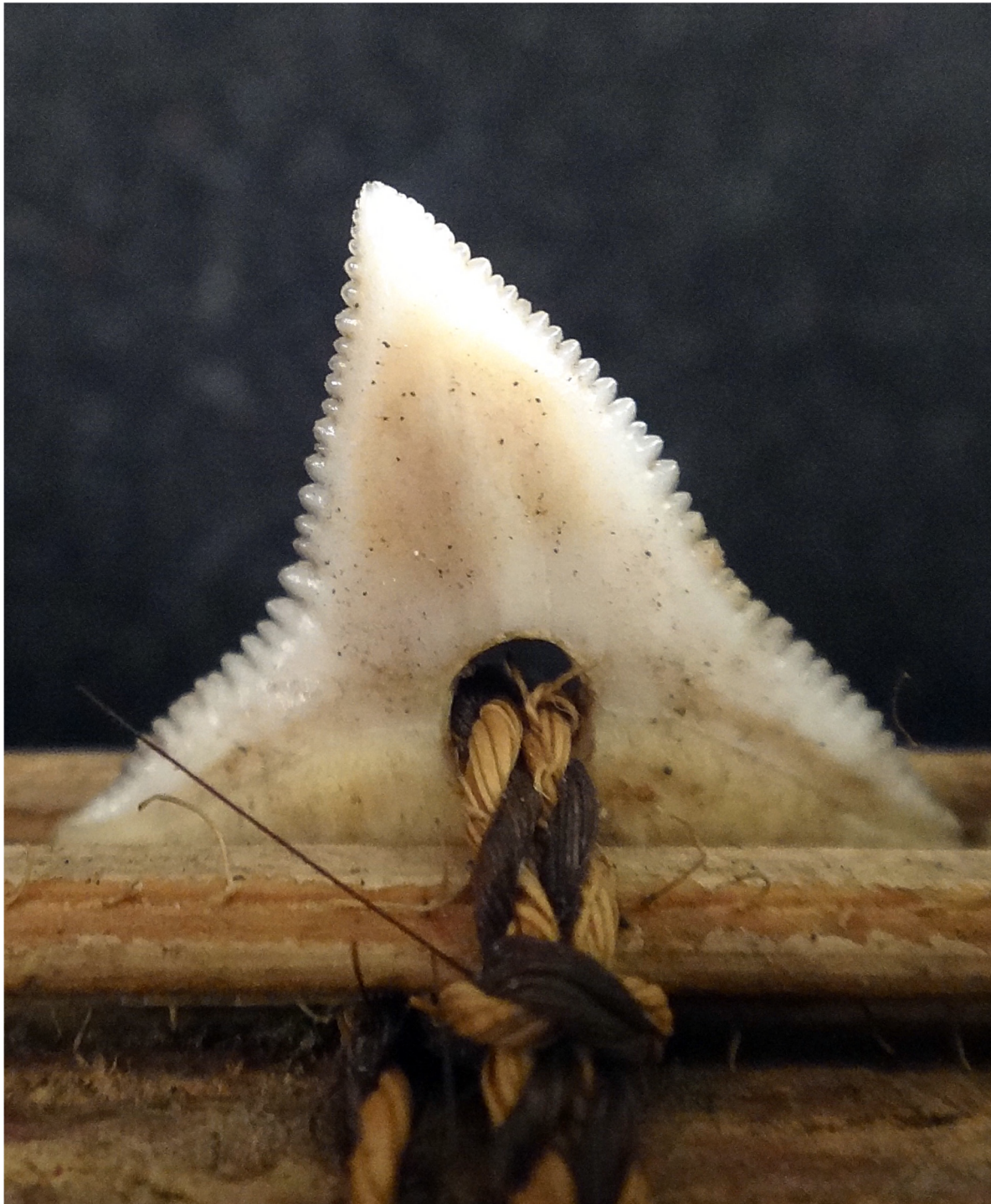
Figure 2. Close up of FMNH 99071 showing how the teeth of Carcharhinus obscurus were attached using braided cord.

We took data from Gilbertese weapons accessioned in the Anthropology holdings of the Field Museum of Natural History