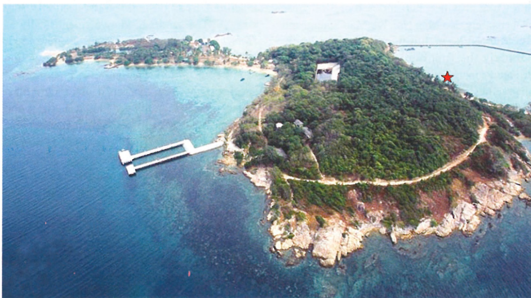
Figure 1 showing (as a star) a site where the sea cucumber was found in the turtle nursing cage, Ko Man Nai, Rayong Province.