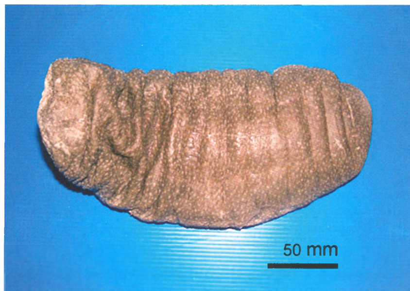
Figure 2 an encountered sand fish, preserved in 70 % ethyl alcohol.