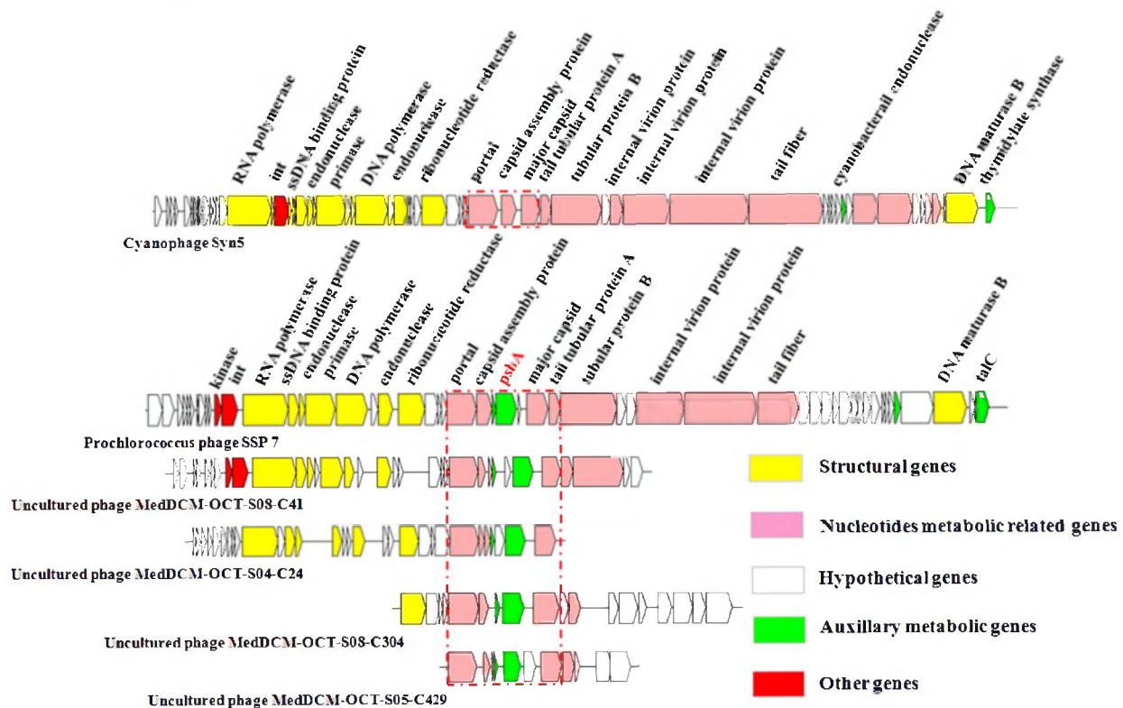
Figure 1 | The structure and organization of cyanopodoviruses and some scaffolds or contigs.

conserved gene cluster “portal- psbA -capsid” 11 . Based on this conserved gene cluster, we searched (BLAST) the GOS scaffold database using portal, capsid assembly, psbA and major capsid protein (MCP) genes, and successfully retrieved 79 cyanopodoviral scaffolds from the GOS database.