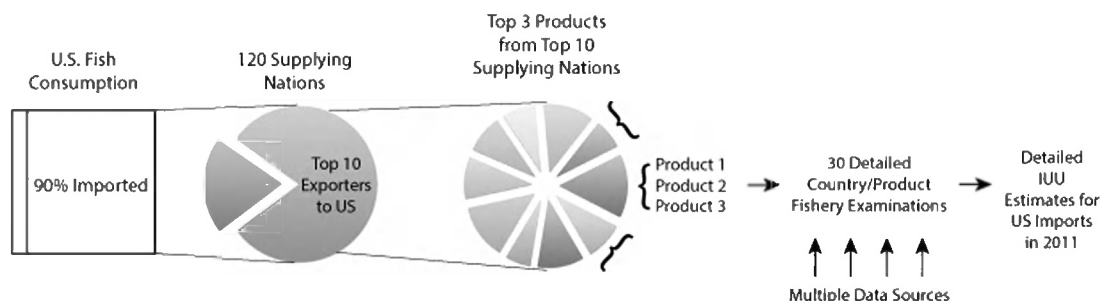
Fig. 1. Methodology diagram: estimating wild caught marine imports into the USA.