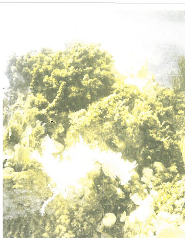
Fig. 1. A patch reef dominated by brown fleshy algae (e.g. Turbinaria spp. and Sargassum spp.) during the extensive bleaching event in 1998 at Glovers Reef Atoll, Belize.

The distribution, abundance and dynamic interactions of species, at several spatial and temporal scales, play an important role in ecosystem resilience following disturbance 37,38 . After disturbance, new successional pathways become available, allowing chance events and new species compositions and interactions to define the equilibrium state. The direction of ecosystem development will depend on which sources of resilience are present for self-organization 36 . Functional diversity, the existence of species that fill similar ecological roles, is important in this context 39 . It provides potential alternative ways to maintain key-functions of the ecosystem in the face of change 34,35,37 . For example, high species diversity within the functional group of herbivores increases the probability that algal grazing after disturbance will remain sufficiently intense to maintain the substrate in a suitable state for coral larvae to settle 23,33 . Following large-scale destruction and extensive mortality within a reef, the relative dependency on external sources for ecosystem resilience will increase. Water currents contribute to resilience by carrying coral