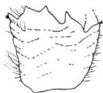
Fig. 1. Parapetrolisthes tortugensis (Glassell). Basal segment of right antennule.

Parapetrolisthes tortugensis (Glassell), n. comb. Fig. 1.